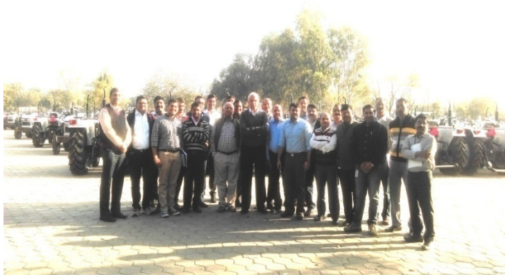
In-house training for a listed farming equipment manufacturing company