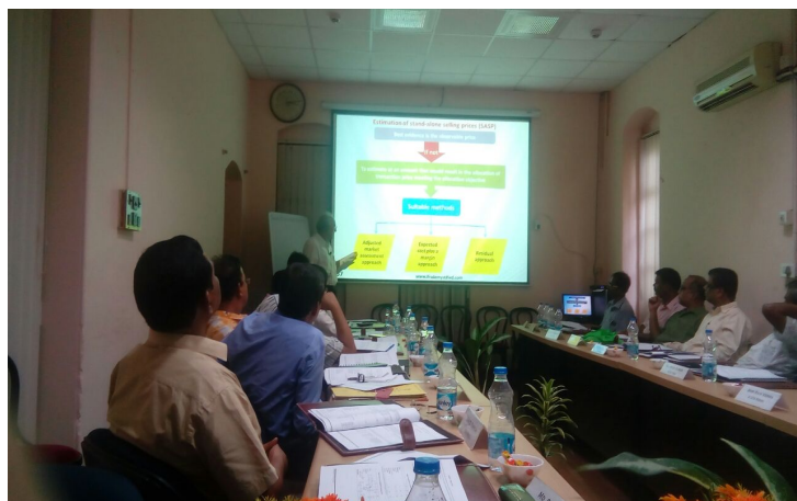
Ind AS 115 training for Department of Telecommunications, Government of India