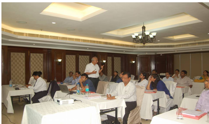
Ind AS Workshop conducted by ACAE at Astor Hotel