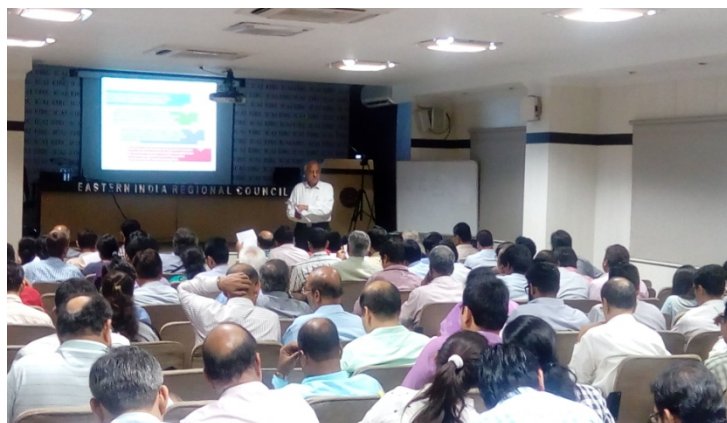
Refresher Course on Ind AS held at EIRC of ICAI