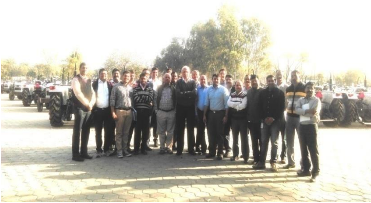
In-house training for a listed farming equipment manufacturing company