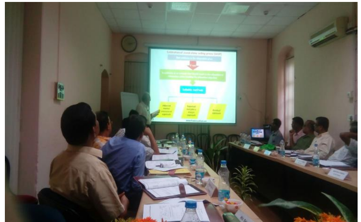
Ind AS 115 training for Department of Telecommunications, Government of India