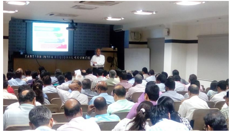
Refresher Course on Ind AS held at EIRC of ICAI