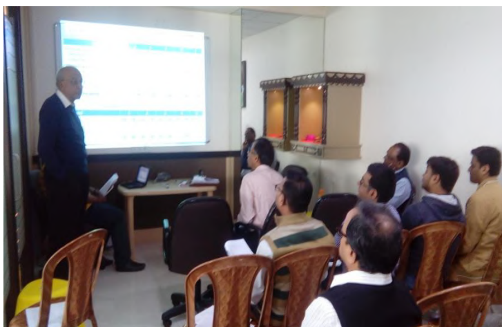
Training for the finance team of a listed FMCG company