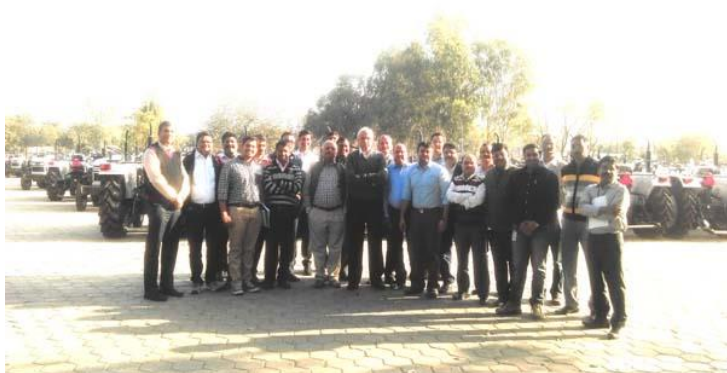
In-house training for a listed farming equipment manufacturing company