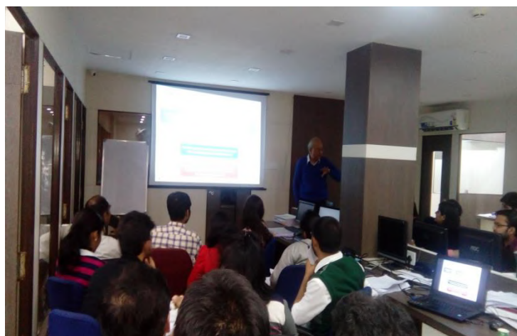
Deliberations on Ind AS for an audit firm