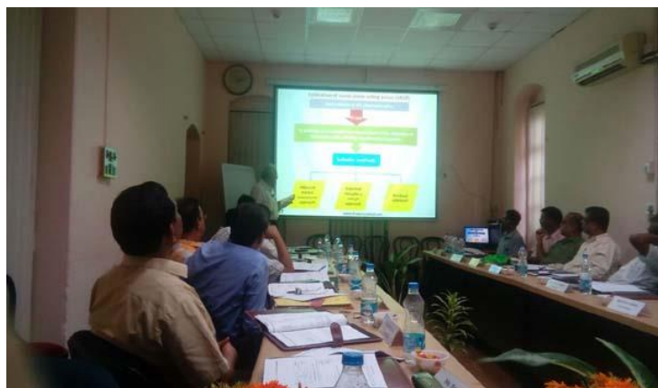
Ind AS 115 training for Department of Telecommunications, Government of India