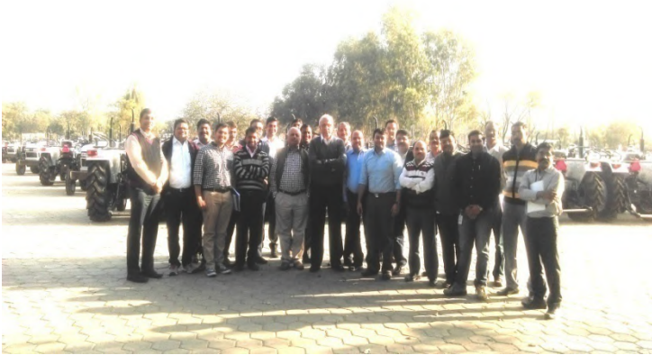
In-house training for a listed farming equipment manufacturing company