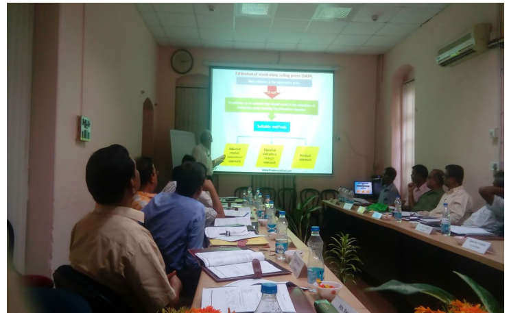
Ind AS 115 training for Department of Telecommunications, Government of India